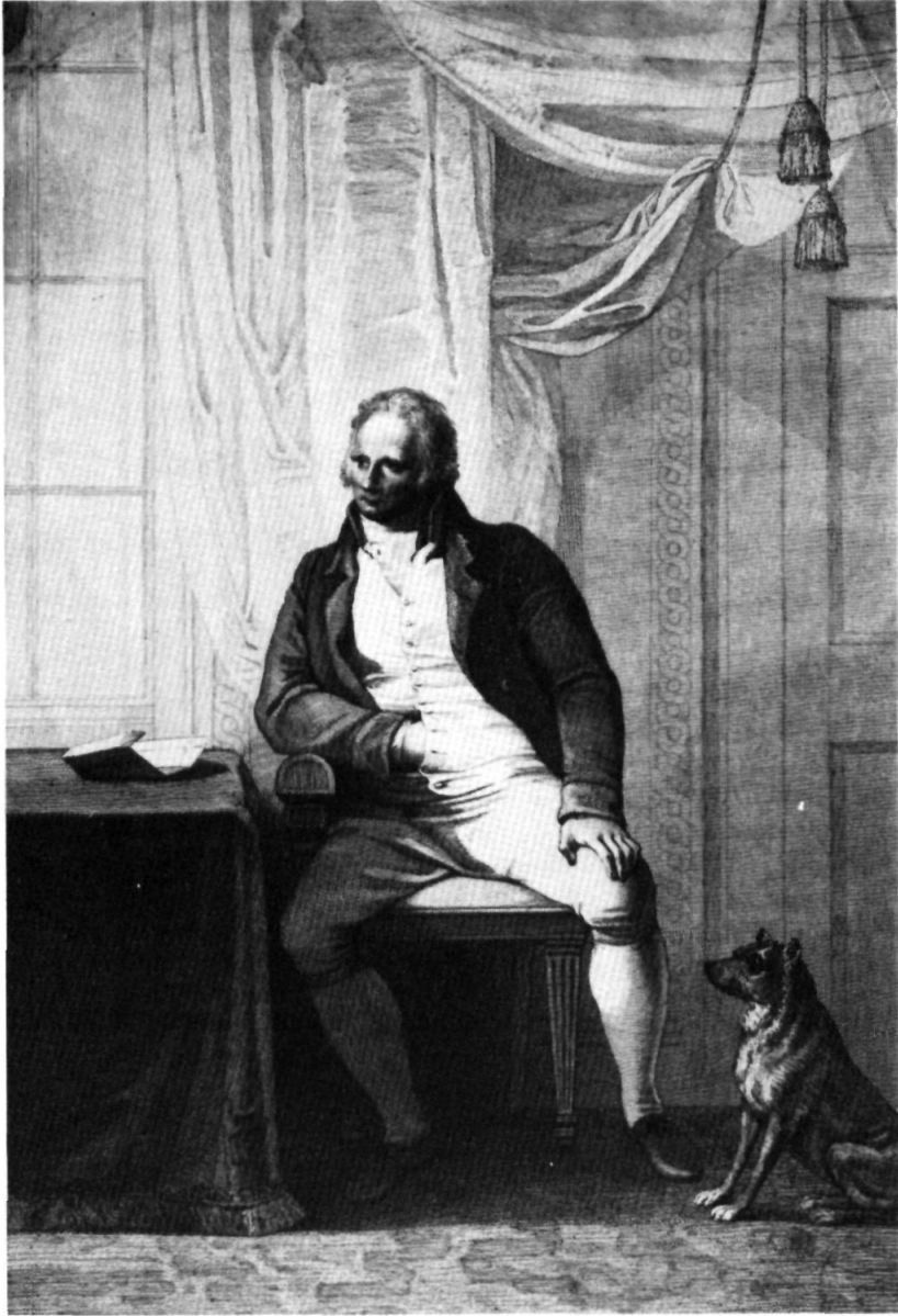
Fig 1. Michael Hoy.